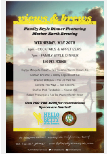
click on image to enlarge poster

Facebook event: https://www.facebook.com/events/895298133862057/